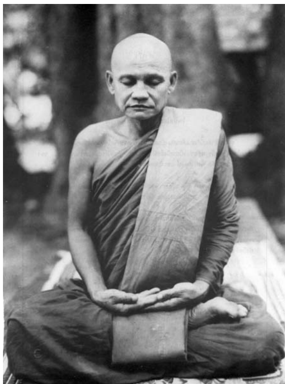
Venerable Ajahn Chah